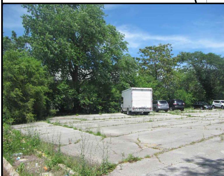
A SITE OVERVIEW